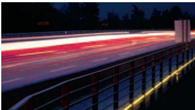
Figure 1 spaceLED used as bridge lighting

TridonicAtco Connection Technology is part of the TridonicAtco and Zumtobel Group, which operates internationally. The business areas of TridonicAtco Connection Technology are divided into installation technology, the lighting industry and household appliances. Great emphasis is placed on the high quality and safety of the products, a fact which is confirmed by more than 20 international inspection marks and marks of quality.